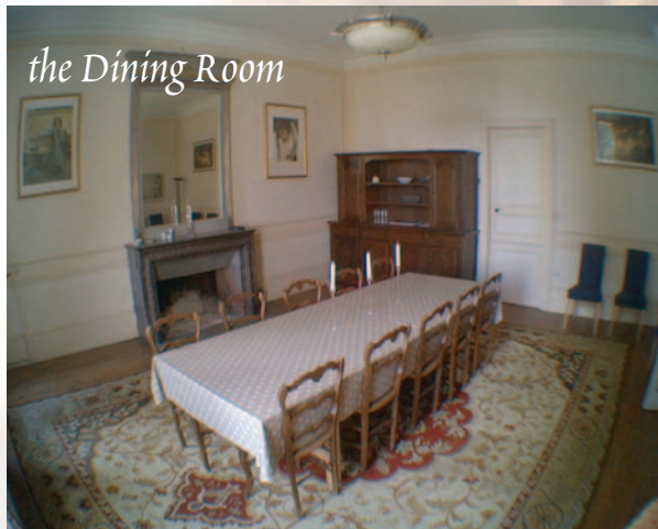
the Dining Room

fireplace, comfortable leather sofas, TV (Satellite), DVD and HiFi. The kitchen is just off the main lounge and has all the standard amenities - microwave, washing machine, dishwasher, gas cooker, fridge, freezer and a number of smaller kitchen appliances (toaster, coffee maker, kettle, etc).